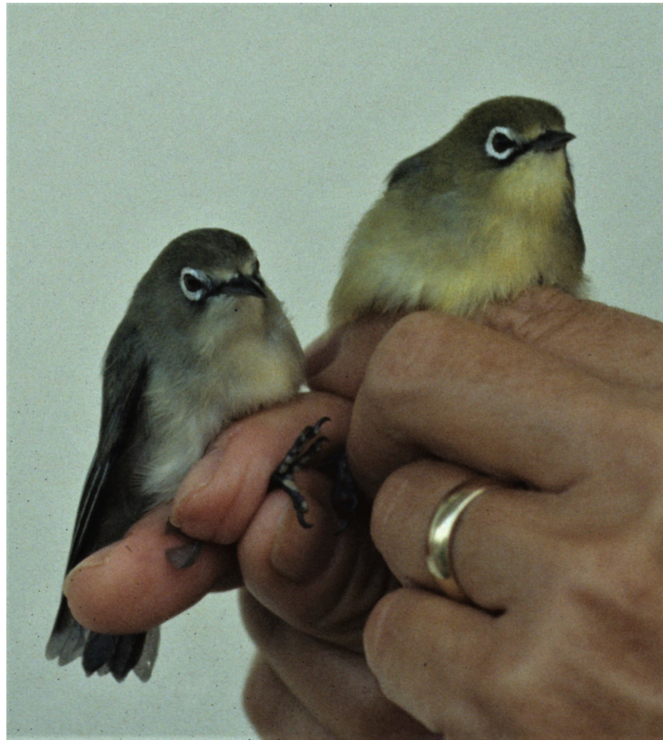
FIG. 4. Juvenile (left) and adult Bridled White-eyes.

age like that of an adult female in its duller red contour feathers and brown wings, as is typical for sexually dimorphic passerines. Based on findings of Pyle et al. (2008), this bird was, however, likely a juvenile male.