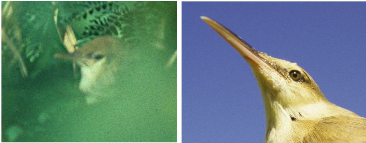
FIG. 4. Juvenile (left) and adult Saipan Reed-warblers.

There are few data on resource abundance for Saipan birds other than that there is greater flowering and fruiting of native forest trees during the wet season (Craig 1996, Fricke et al. 2017a,b, Linck et al. 2020) and that forest greenness is greatest during the wet season (Saracco et al. 2016). Although wet season flowering suggests that there is an energetic advantage for the nectarivorous Micronesian Myzomela to breed during the wet season, this is not necessarily so for the remaining species. The Bridled White-eye, although versatile in its foraging, is principally a forest canopy foliage gleaner (Craig and Beal 2002). Similarly, the Saipan Reed-warbler is reported to have an entirely carnivorous diet (Craig 1996). As also pointed out by Saracco et al. (2020), only further study can elucidate the mechanisms that drive the choice of season for peak breeding.